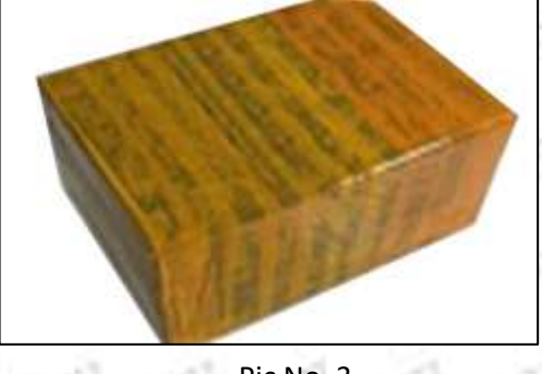
Pic No. 3 International express packaging: Wrapped with yellow tape after wrapping black protective film